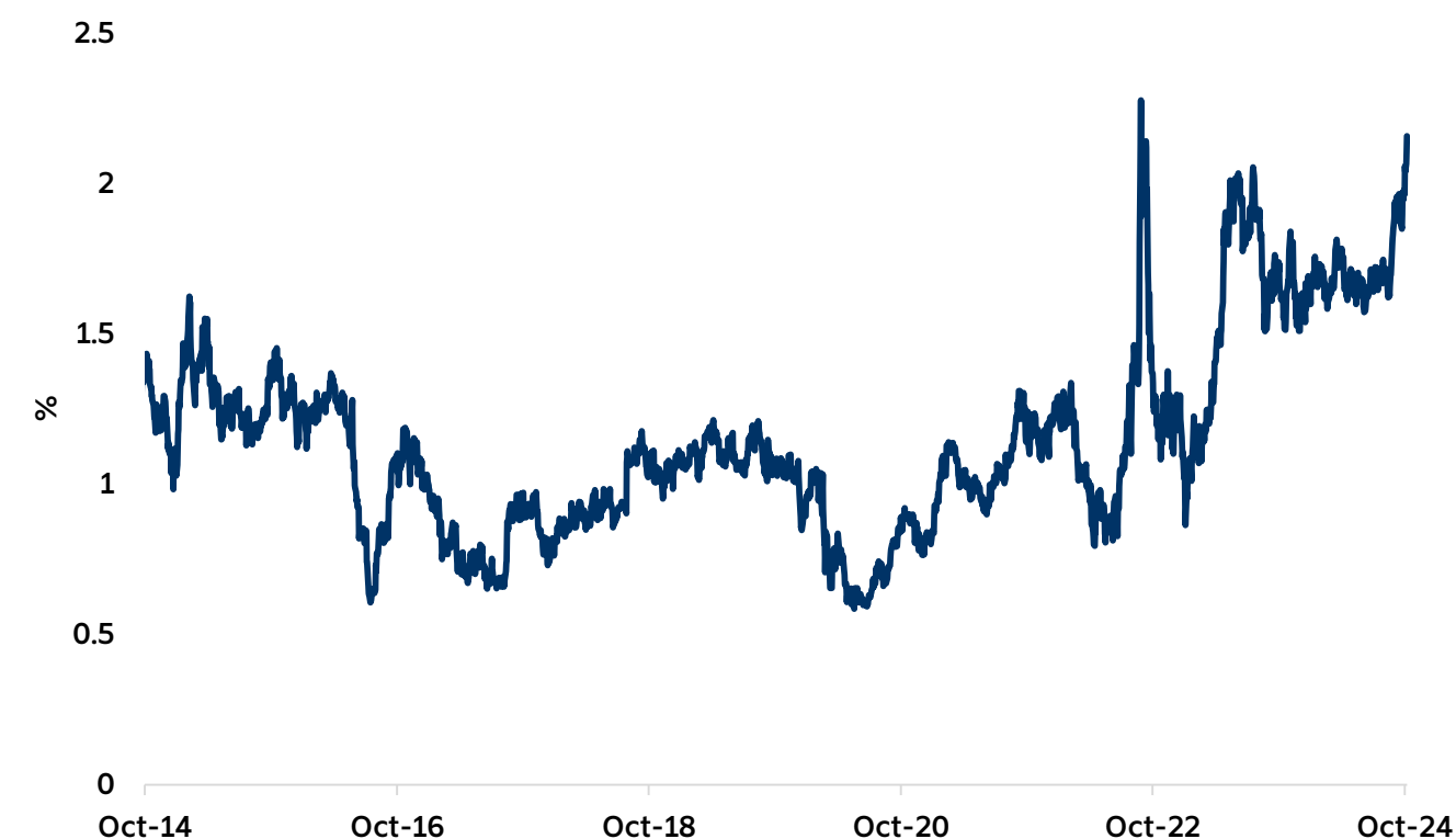
Yield spread between 10-year UK and 10-year German government bonds